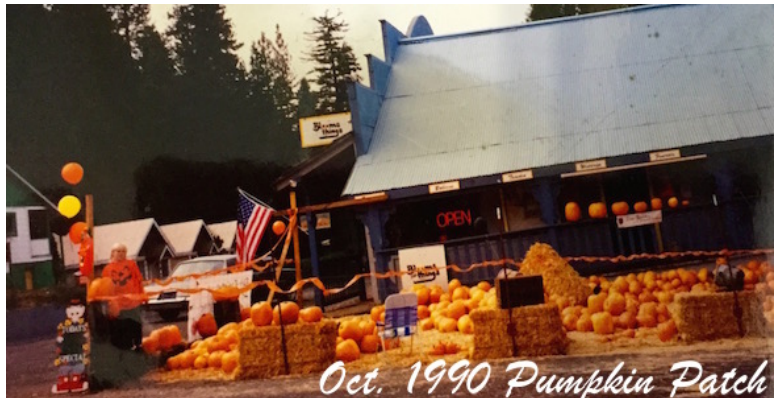
Oct. 1990 Pumpkin Patch

As the 1990's approached, Vicki's parents sold their restaurant and Blooms & Things moved to the Junction Building more popularly known in the 80's as "Whiskey River" (formerly the location of the old Arnold Post Office). This move increased building space by three times and the staff included Vicki, Ron, Iva, Cecil, all three sons, aunts, uncles, brothers, sister, nieces and nephews. It was during this phase that Blooms and Things partnered with Hallmark Corp. carrying Cards and gifts in their product line.