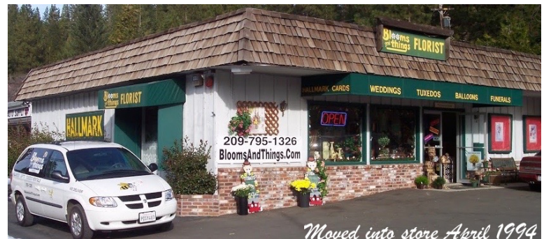
Moved into store April 1994