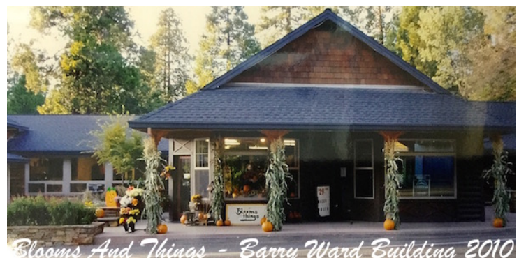
Blooms And Things - Barry Ward Building 2010

While we went through the loss and disappoint of losing two stores in a short amount of time, our Angels Camp store continued to hold steady throughout the entire economical downturn. In 2012, we noticed business increasing at a steady pace with 2015 proving to be our best year in business since we opened in 1985.