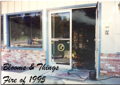
Blooms & Things Fire of 1995