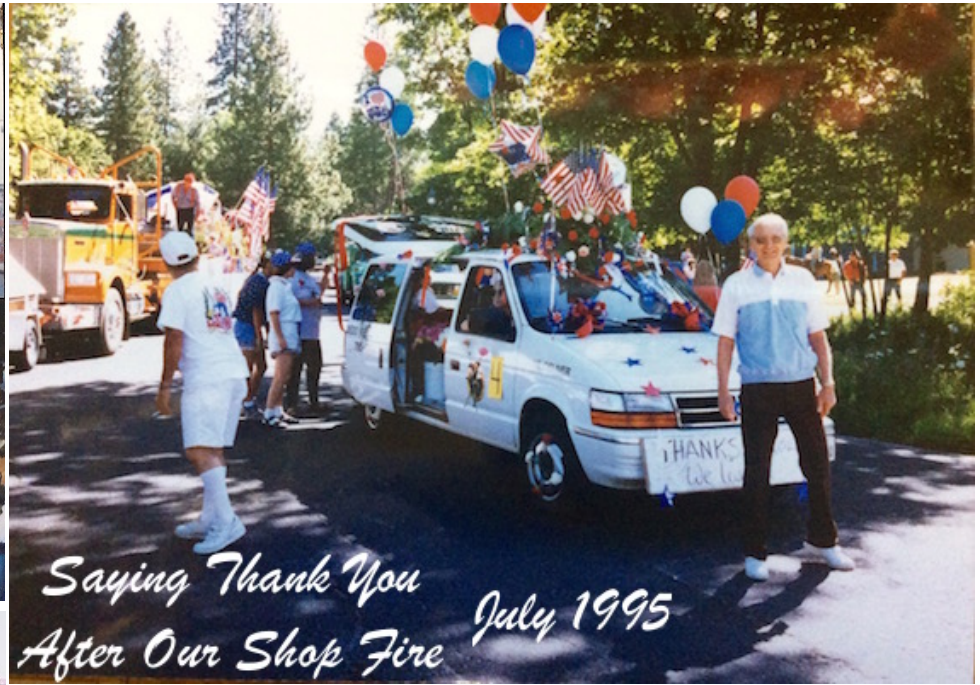
Saying Thank You After Our Shop Fire July 1995

In an effort to make it through the tough economical climate, we made a decision to downsize our Arnold store located at AppleWood Center and move to a smaller location at the Barry Ward building . The year was early 2009. However, by the time 2010 arrived, it was realized that we weren't going to make it through the tough economical downturn. In November 2010, we closed our final version of the Arnold store.