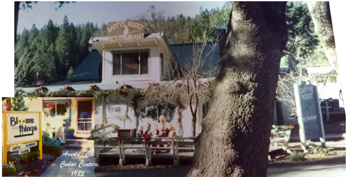
Arnold, Ia Cedar Center 1985